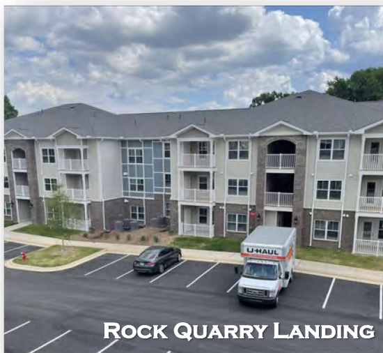
ROCK QUARRY LANDING