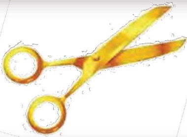
EAST HAVEN ROCKY MOUNT, NC