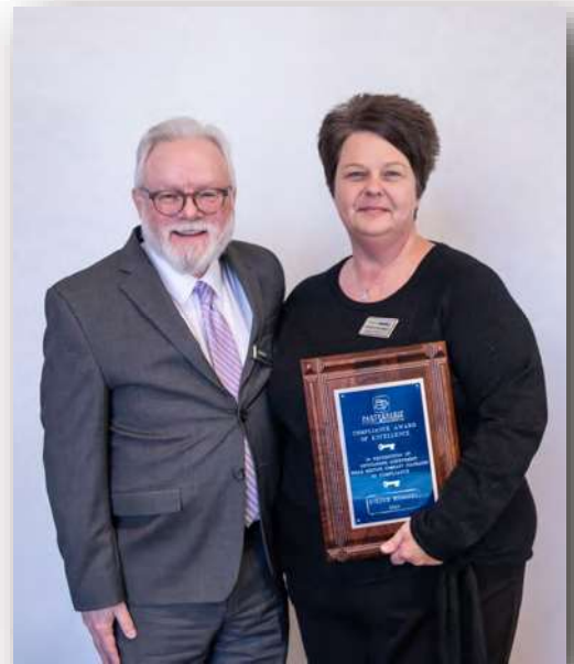
Diedra Hummel Westwind Village I & II Gaffney, SC