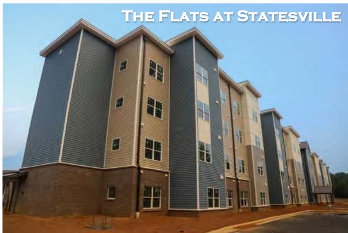
THE FLATS AT STATESVILLE