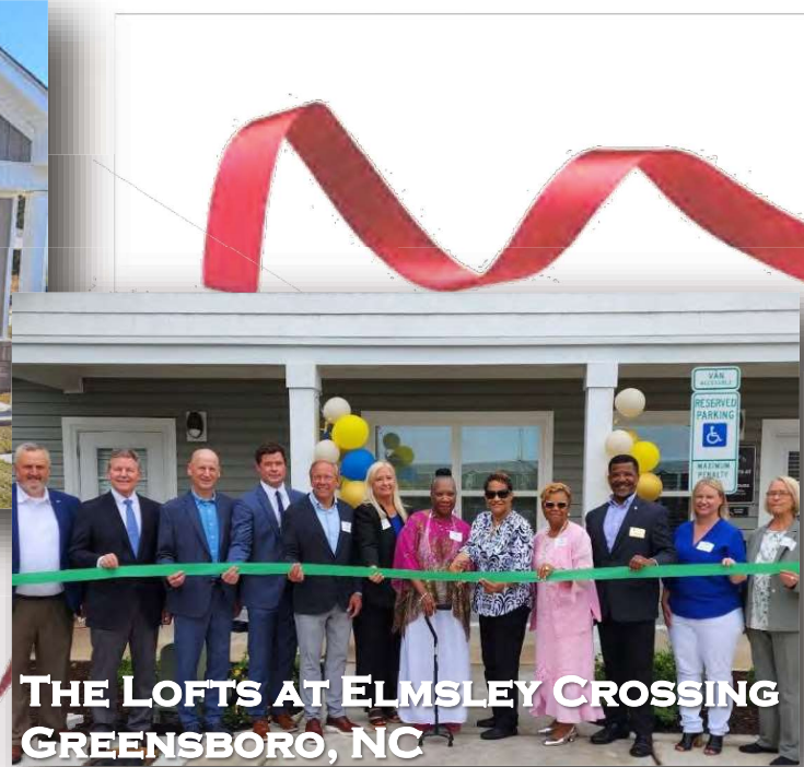
THE LOFTS AT ELMSLEY CROSSING GREENSBORO, NC