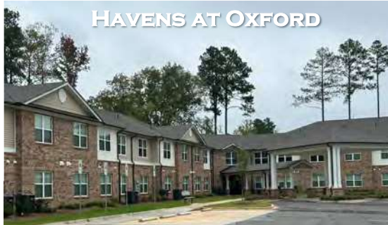
HAVENS AT OXFORD