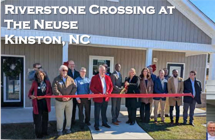
RIVERSTONE CROSSING AT THE NEUSE KINSTON, NC