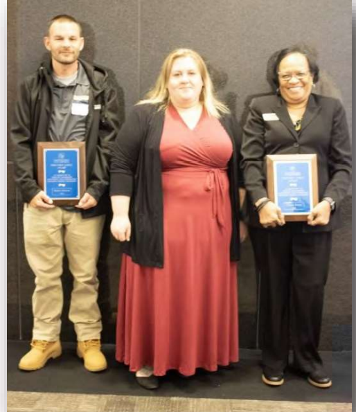
Randle Hawkins Arbor's Park and Deer View in Ayden, NC Yvonne Brown Edgewood Place in Tarboro, NC