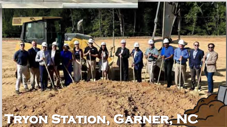
TRYON STATION, GARNER, NC