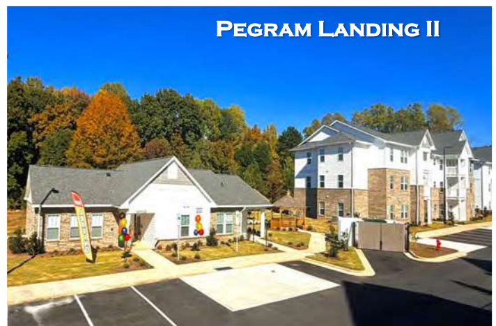
PEGRAM LANDING II

K eeping its promise, 2024 was another busy year for our team. We added 12 new construction properties to our portfolio that are providing 1,072 units of new housing to individuals and families. The rehab of 38 units at Pungo Village in Belhaven, North Carolina was completed just in time for residents to enjoy the upgrades through the holidays. The Flats at Statesville, an 84-unit family site in Statesville, North Carolina, opened the first week in January 2025 and is leasing up quickly.